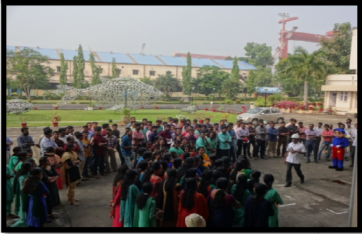
@ Main office