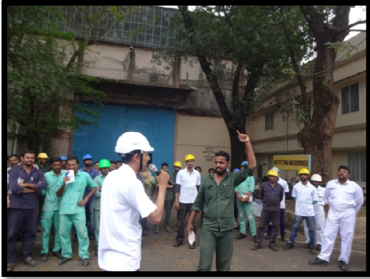
@ OW Store