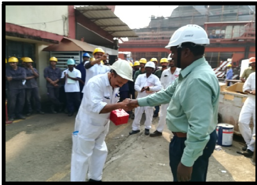
@ HE store