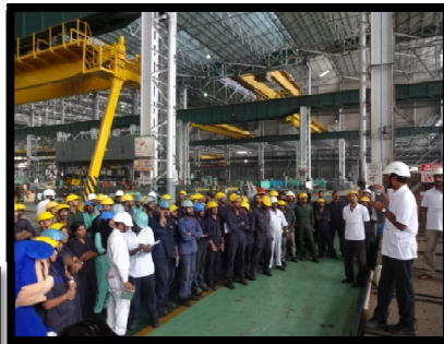
@ Hull Shop