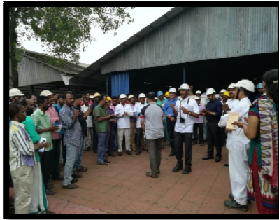
@ Contractors canteen