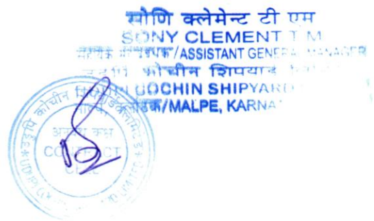
Assistant General Manager (Materials & Contract Cell)