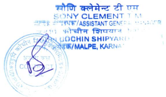
Assistant General Manager (Materials & Contract Cell)