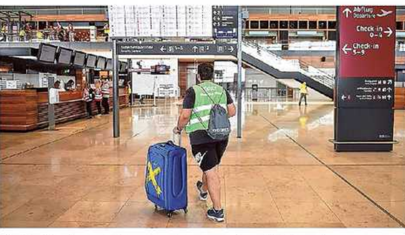
The facility for RT-PCR testing is currently available only at some places including Delhi, Hyderabad and Mumbai airports.

The other guidelines largely remain similar to what the MOHFW had issued in August this year including that international passengers arriving without RT-PCR negative certi-